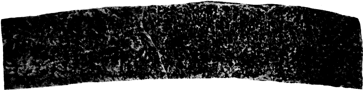
9. Rock Edict of Asoka (Gujarra).

This is Asoka’s testament against war. It graphically depicts the tragedy of war and shows why he turned against it. It is a unique event in the annals of the ancient world because we do not know of any other contemporary monarch who renounced war. Asoka embarked on the policy of Dhamma after this war.